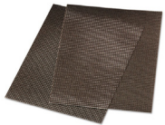
Scotch-Brite Griddle Screen