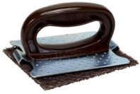
Scotch-Brite Griddle Pad Holder