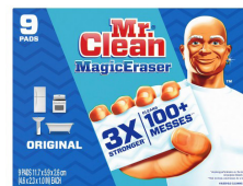
Mr. Clean Magic Eraser