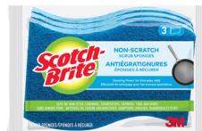
Blue Scotch- Brite Sponge