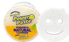
Scrub Daddy Power Paste