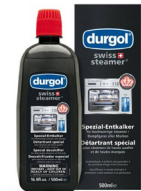
Durgol Swiss Steamer Descaler